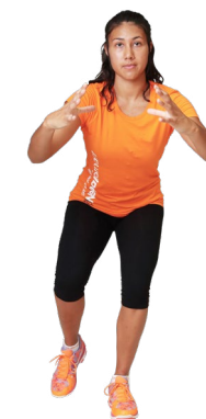
[FRONT ON VIEW]